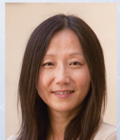
Zhenan Bao (Stanford Univ.)

Exploration for Beyond CMOS Integrated Circuit Technology for Computing